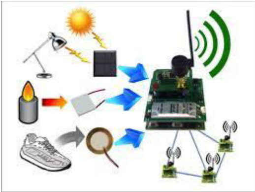
Figure 1: WSN organize

and initiate an efficient resolution to minimize charging delay in such networks.