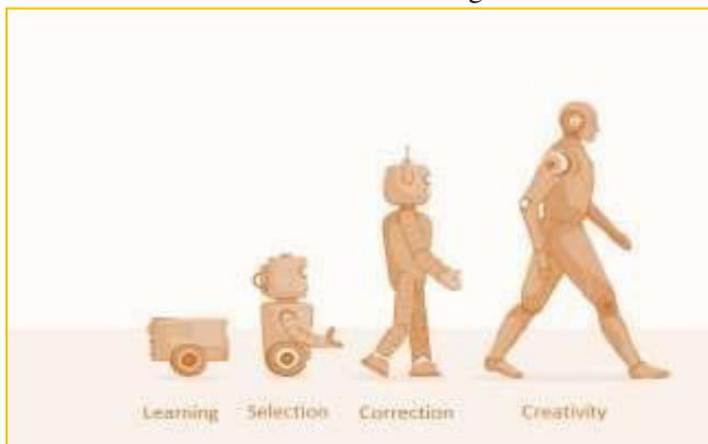
Fig. I: Four major stages of AI programming

There are four major stages of AI programming to make it easier and convenient to the users are given as follows.