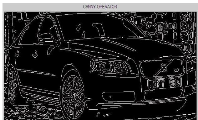
Figure 3: EDGE DETECTION USING “CANNY” OPERATOR