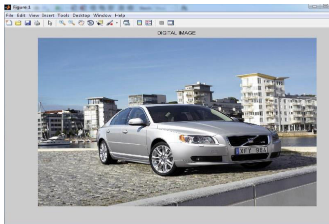
Figure 1: INPUT IMAGE FOR TESTING THE PROPOSED ALGORITHM