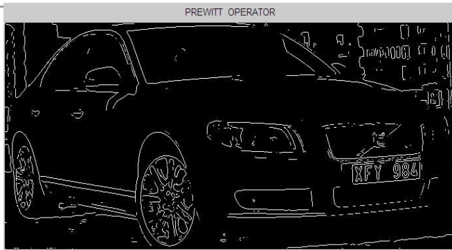
Figure 4: EDGE DETECTION USING “PREWITT” OPERATOR