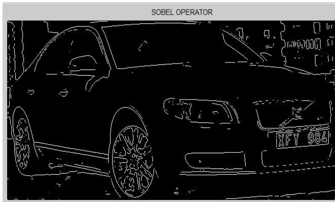
Figure 5: EDGE DETECTION USING “SOBEL” OPERATOR