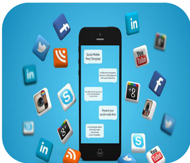
Figure 1: Mobile Social Cloud

The popularity mobile applications are evident by looking through mobile app download centres such as Google Play Store and Apple's resources. MSCC is a computing environment that integrates social network-based cloud computing and mobile devices [2]. The Paradigm is evolved keeping mobility in mind known as the Mobile Social Cloud. Nowadays most of applications are available on mobile and handheld devices. Thus a device of mobile user may belong to several SNs. Mobile devices in MSCC create SNs based on real world human relationships among mobile users. Members of a SN share cloud services based on basic authentication of the SN without Any.further.authentication.